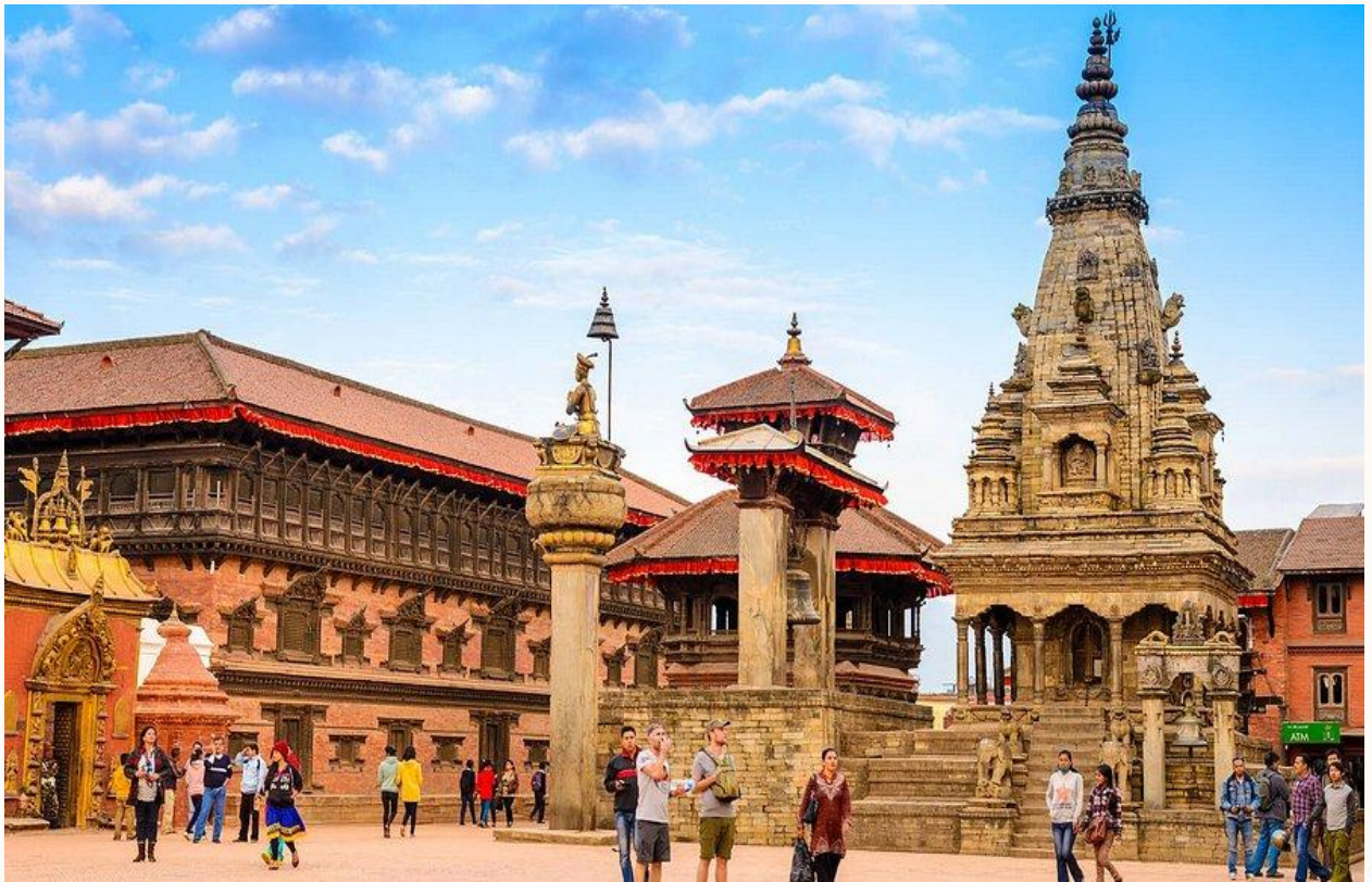
Bhaktapur Durbar Square