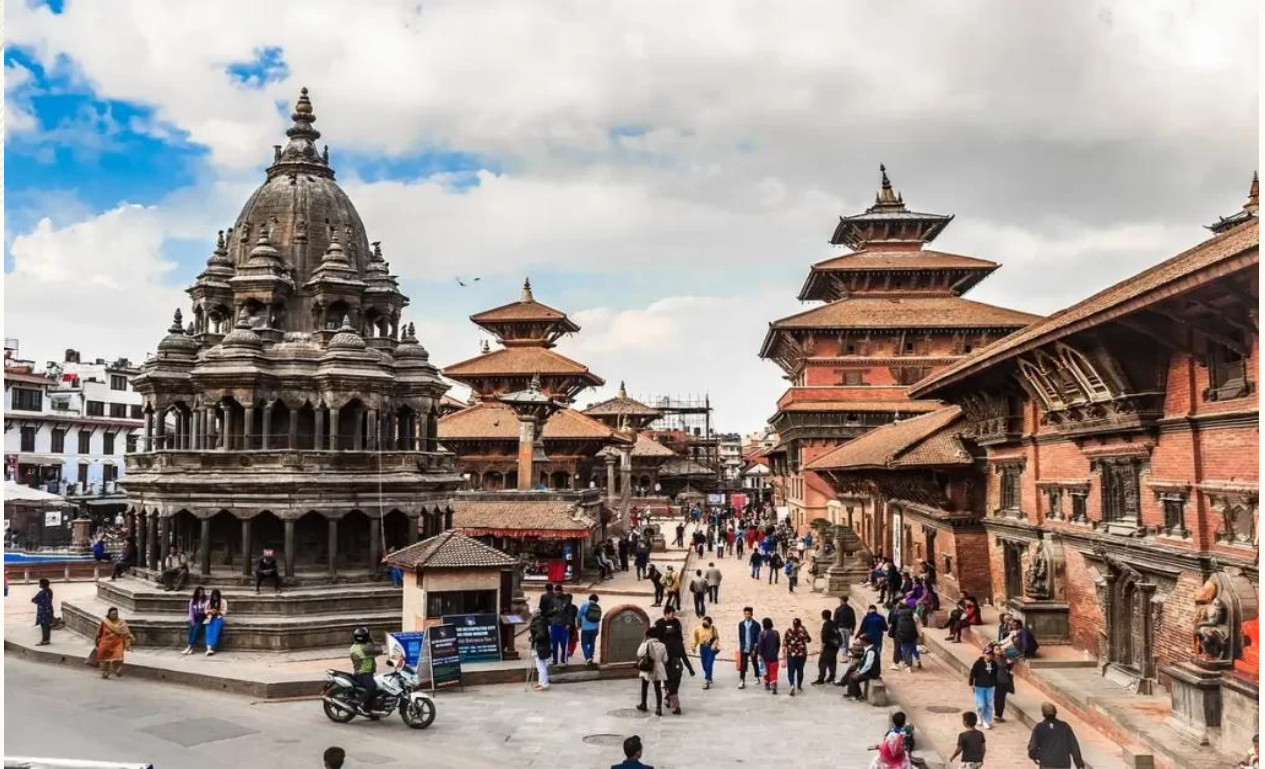
Patan Durbar Square